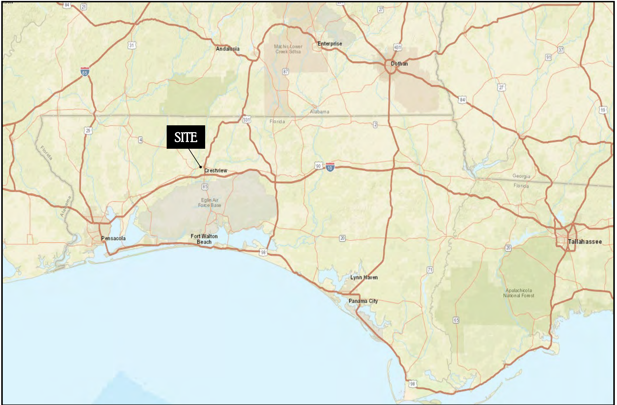
CRESTVIEW MARKETPLACE ~ CRESTVIEW, FLORIDA