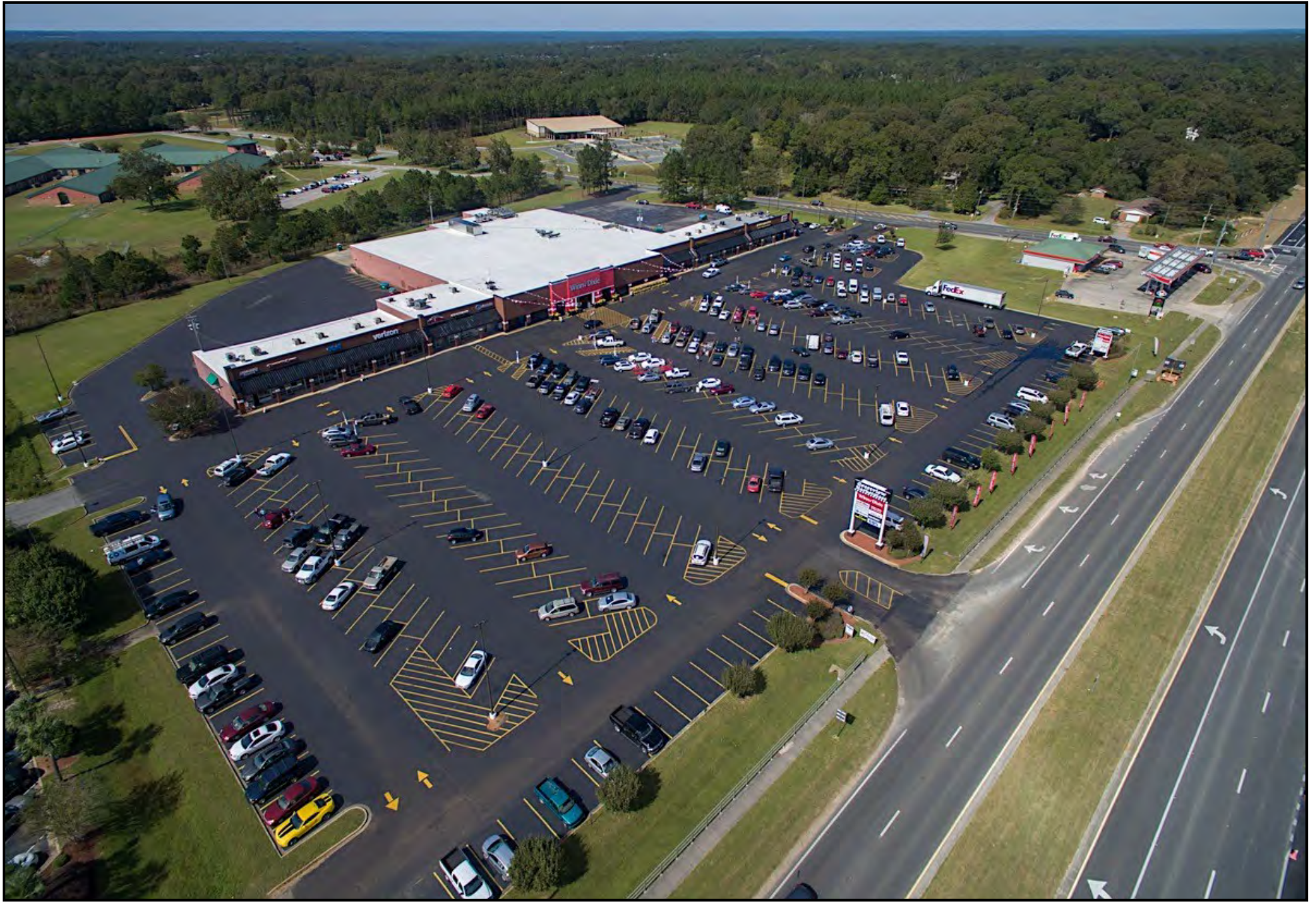
CRESTVIEW MARKETPLACE ~ CRESTVIEW, FLORIDA