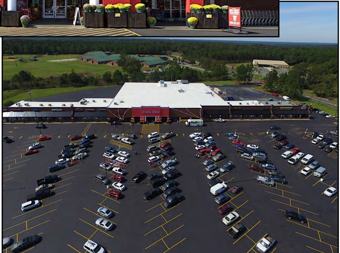
CRESTVIEW MARKETPLACE ~ CRESTVIEW, FLORIDA