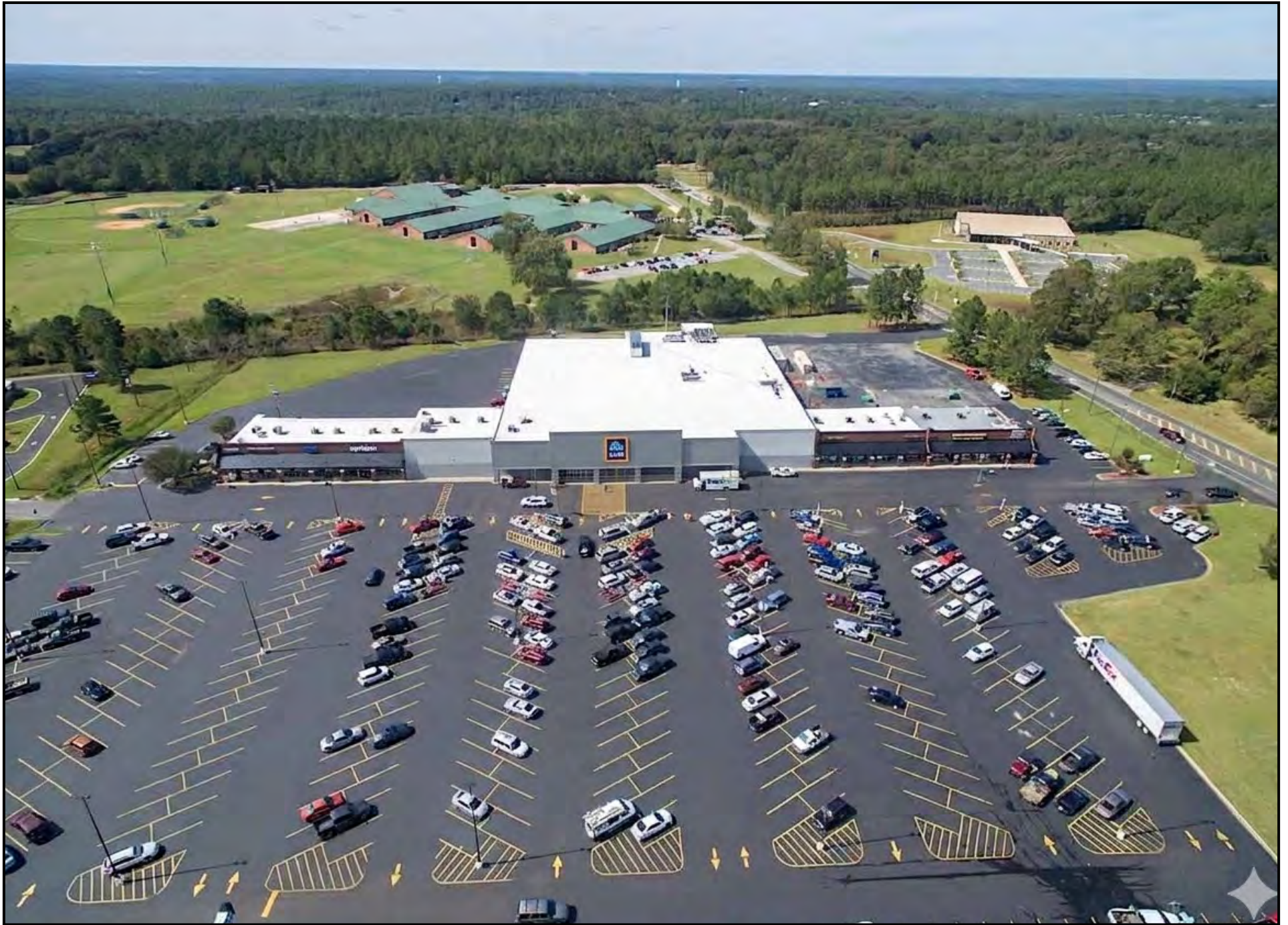
CRESTVIEW MARKETPLACE ~ CRESTVIEW, FLORIDA