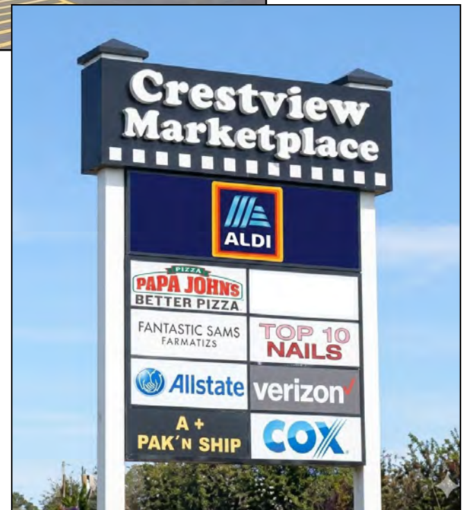
CRESTVIEW MARKETPLACE ~ CRESTVIEW, FLORIDA