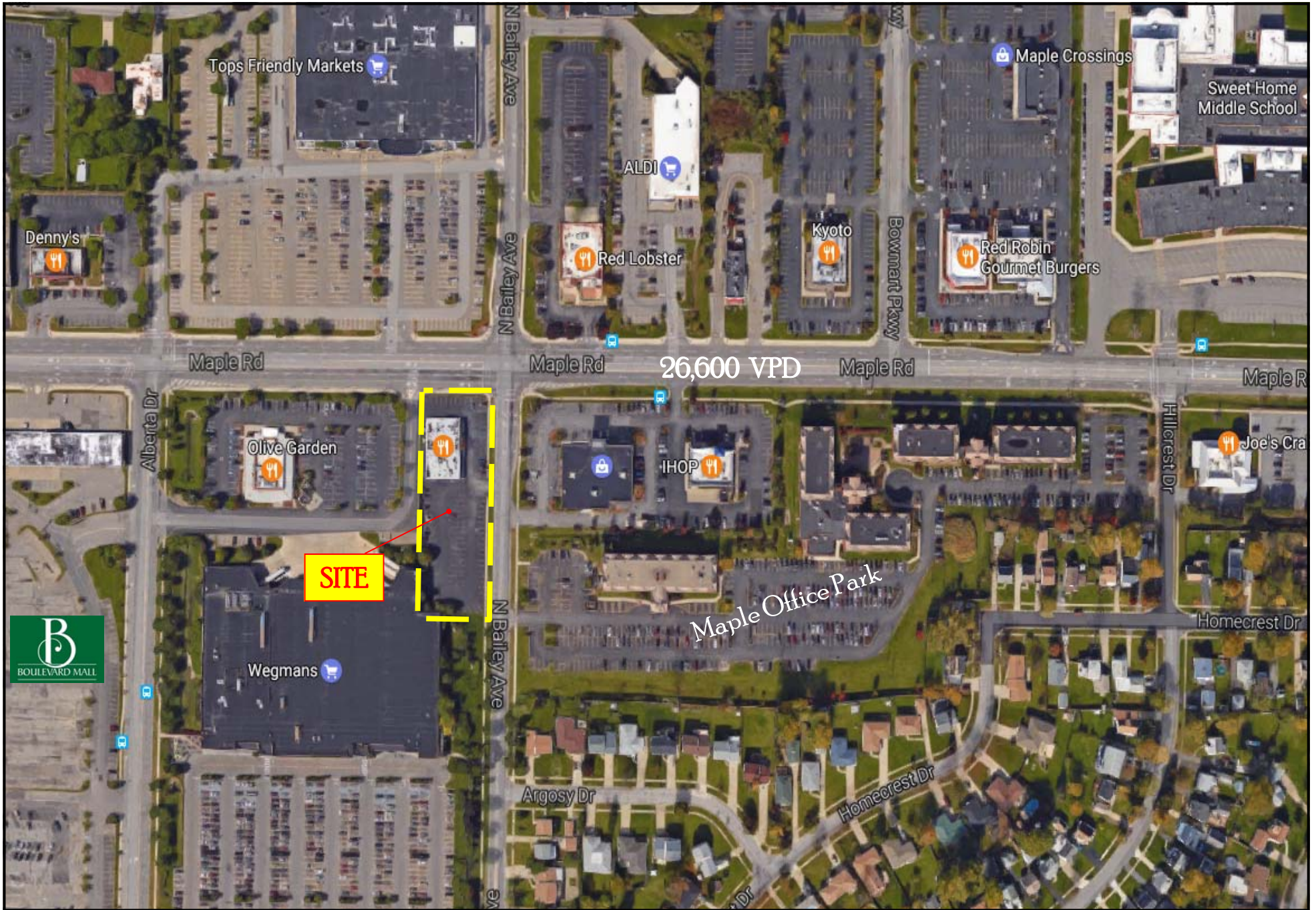
FORMER SCOTCH N SIRLOIN ~ AMHERST, NEW YORK