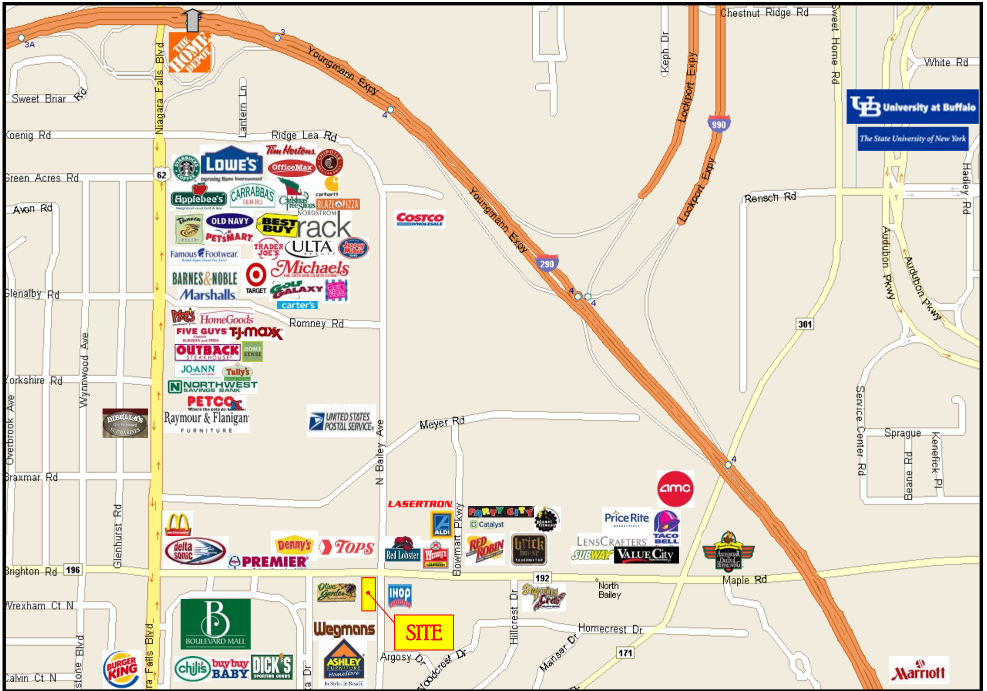
FORMER SCOTCH N SIRLOIN ~ AMHERST, NEW YORK