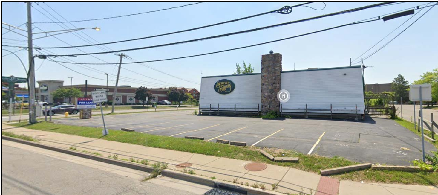
View From Maple Rd