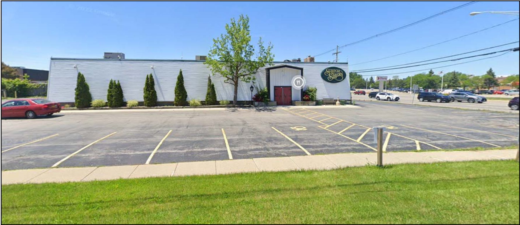
View From N. Bailey Ave