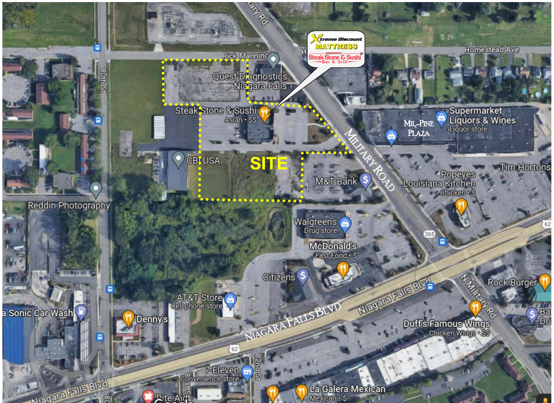
5.5 ACRE DEVELOPMENT ~ NIAGARA FALLS, NEW YORK