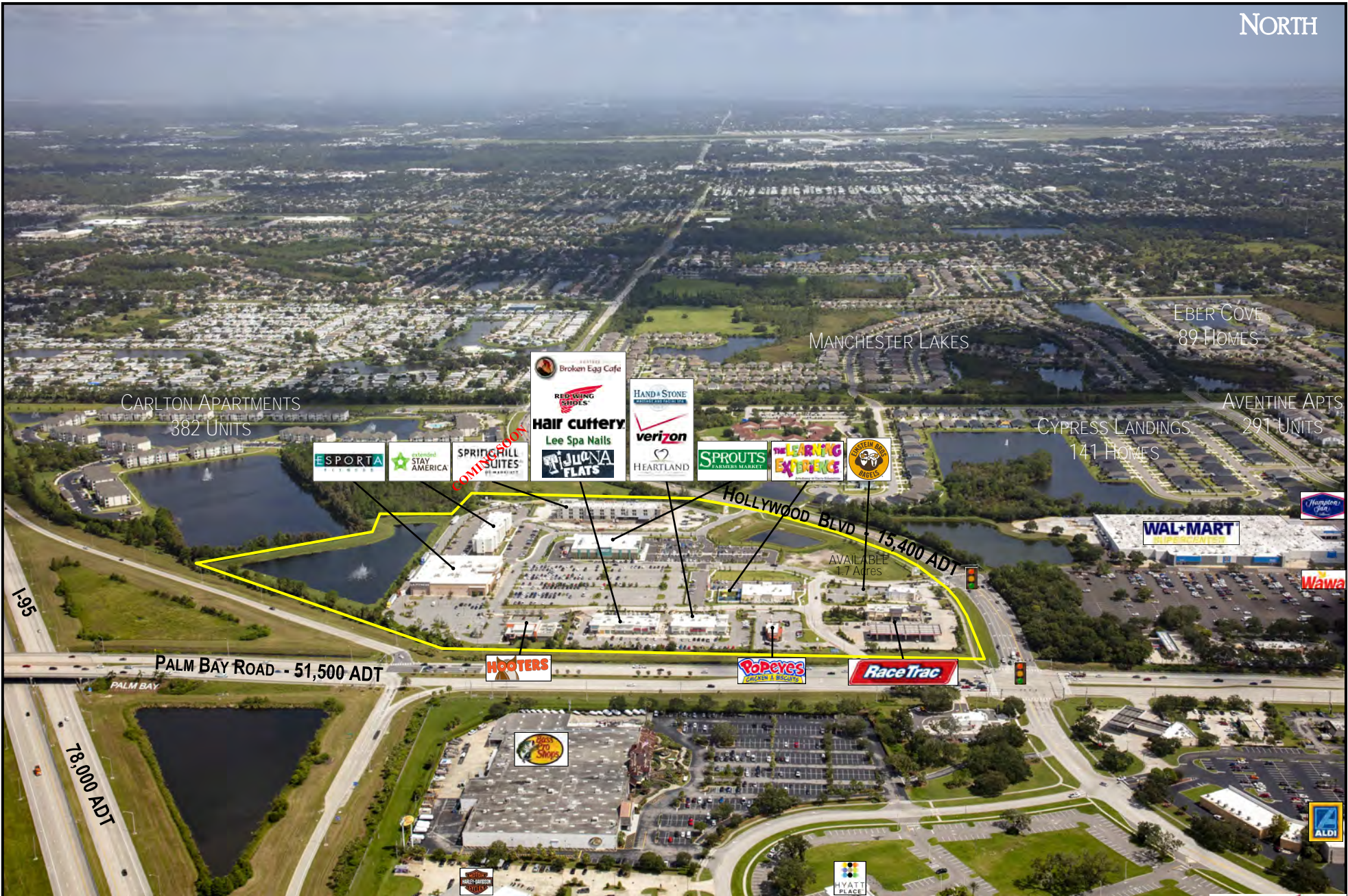
WEST MELBOURNE INTERCHANGE CENTER ~ WEST MELBOURNE, FLORIDA