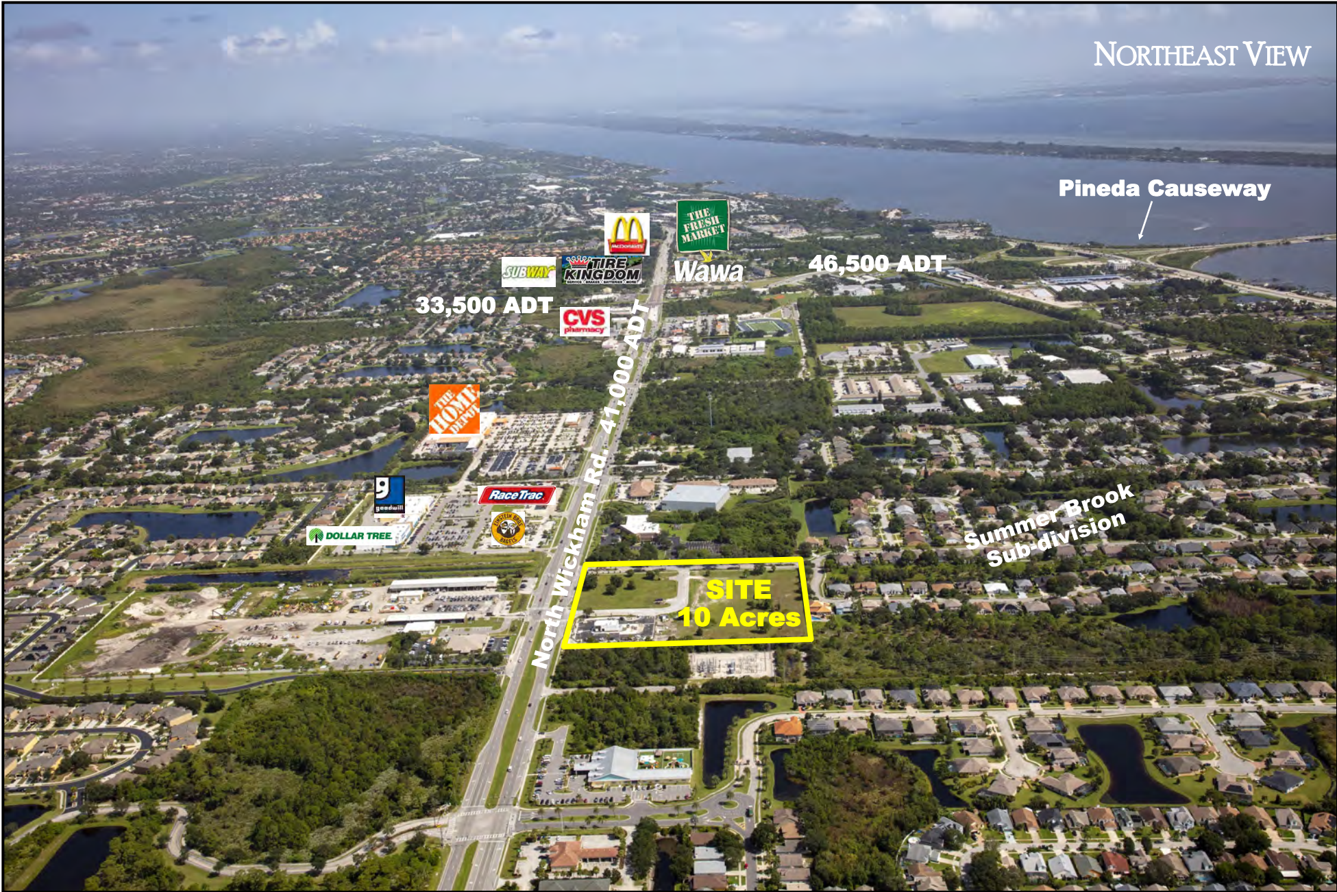
SUMMER BROOK COMMONS ~ MELBOURNE, FLORIDA