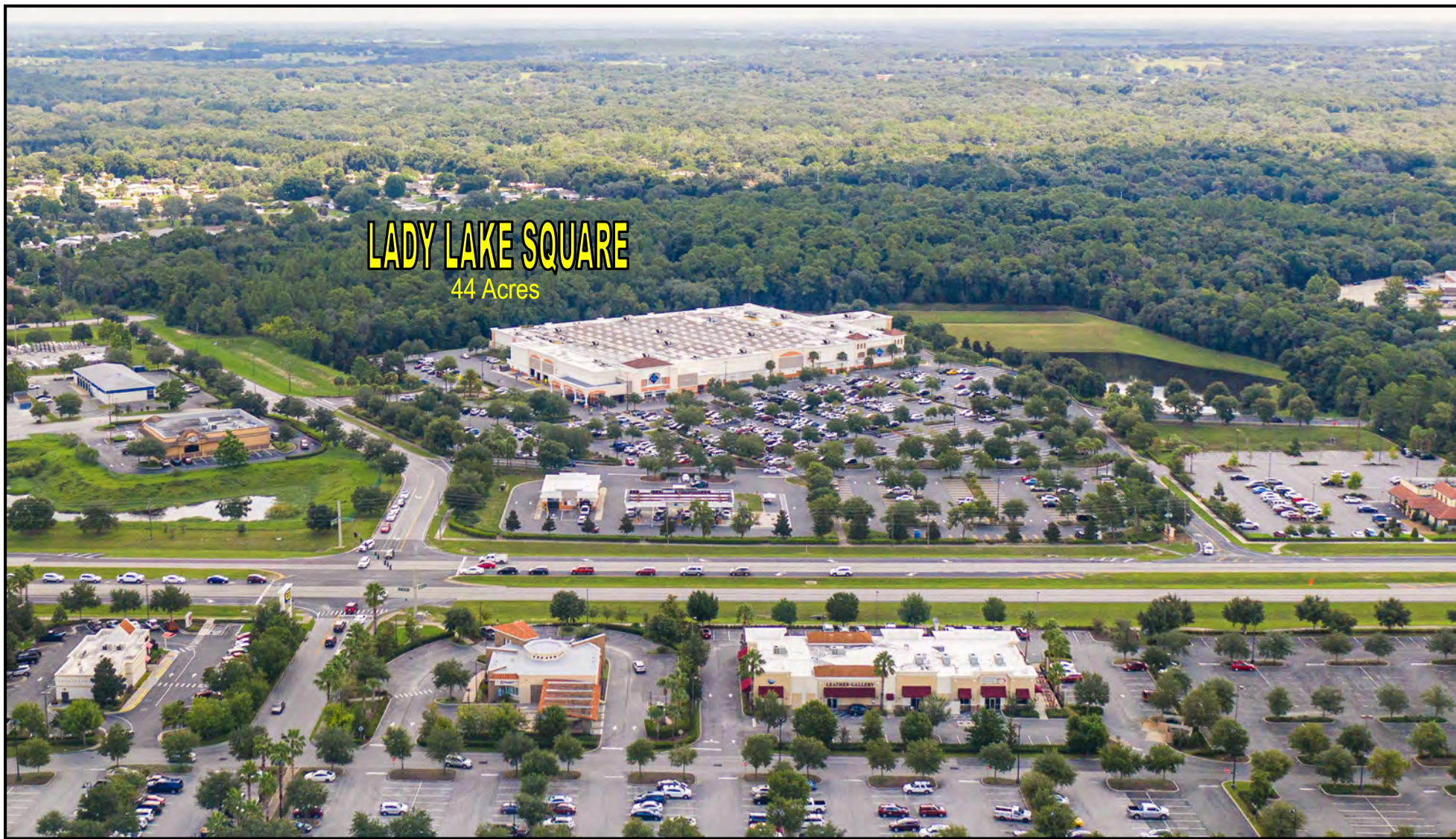
LADY LAKE SQUARE ~ LADY LAKE, FLORIDA