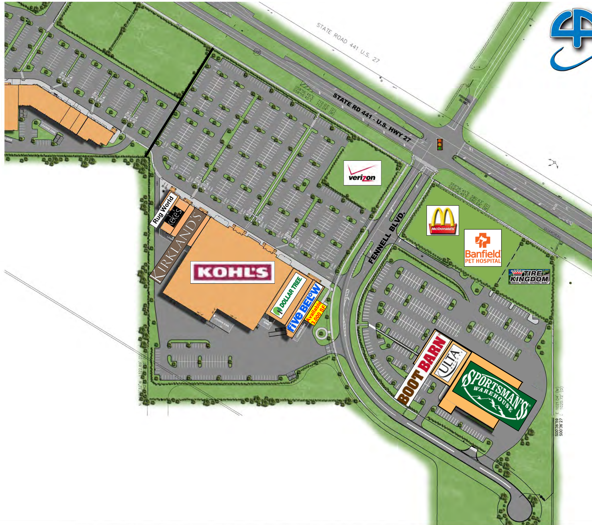
Lady Lake Crossing @ Hwy 441/27 - Lady Lake, FL