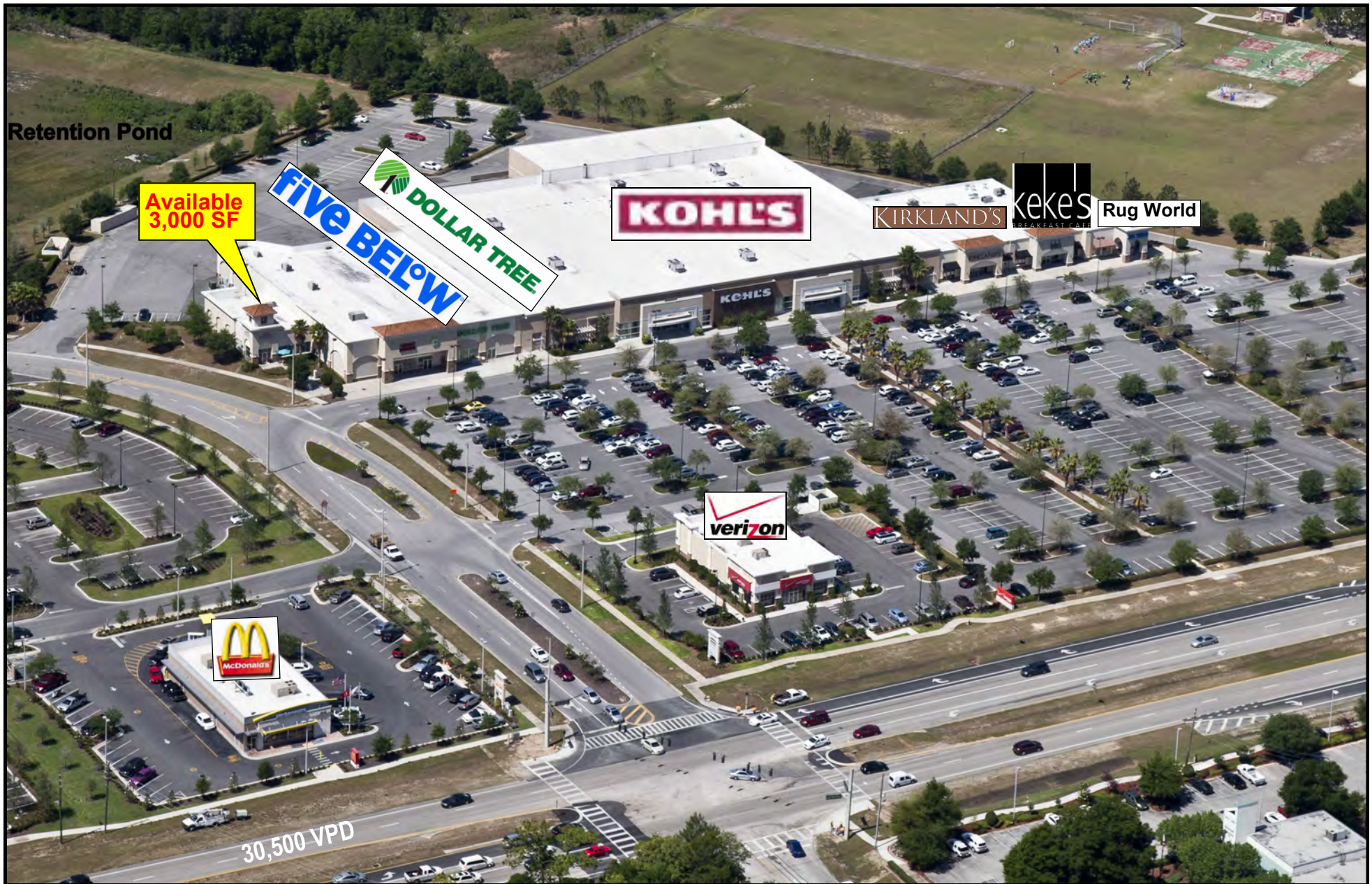
LADY LAKE CROSSING ~ LADY LAKE, FLORIDA