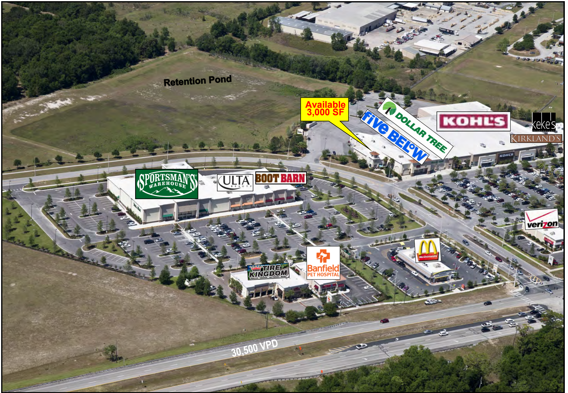
LADY LAKE CROSSING ~ LADY LAKE, FLORIDA