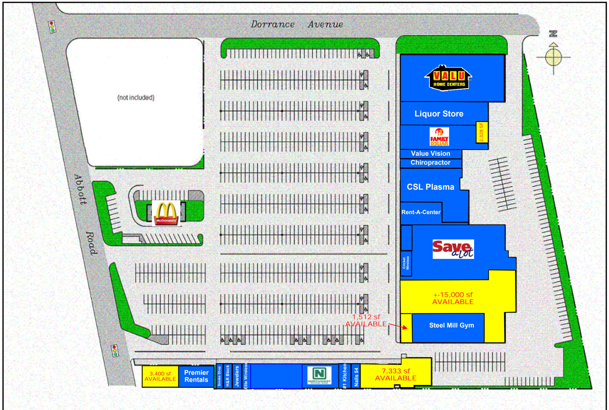
ABBOTT ROAD PLAZA ~ LACKAWANNA, NY