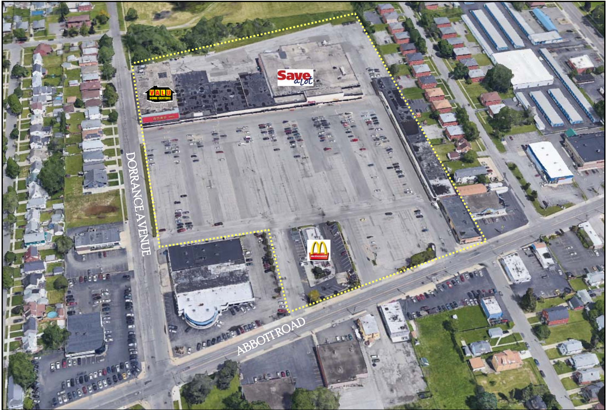
ABBOTT ROAD PLAZA - LACKAWANNA, NY